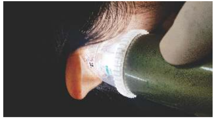
Figure-1 (d): Uniform contact achieved in a difficult-to-access area