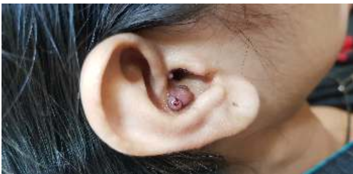
Figure-1 (a): A difficult-to-access area: the aural concha