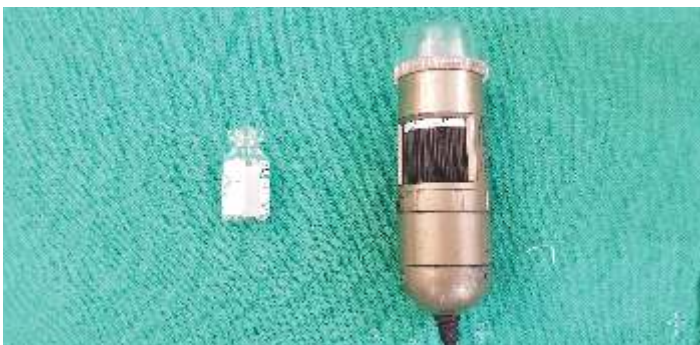
Figure-2 (a): A difficult-to-access area: the aural concha