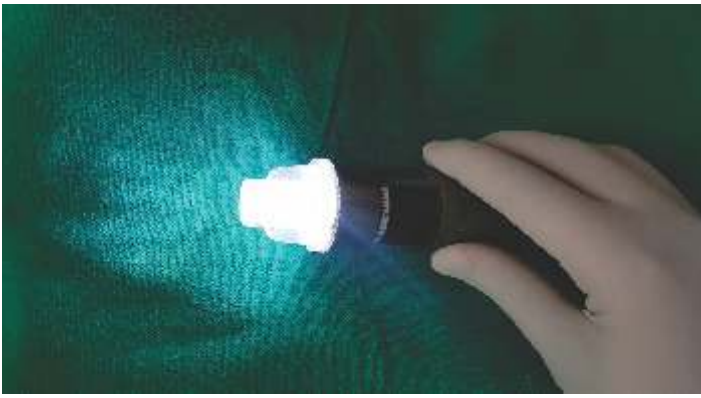
Figure-1 (c): Insertion of the said vial into the central column, making it a perfect fit