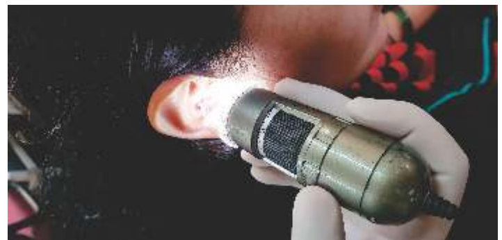
Figure-1 (b): Inability to establish contact with the existing plate in the said area