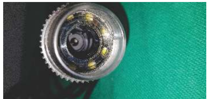
Figure-2. (a)&(b): A simple, transparent glass vial with the videodermoscope (c) Insertion of the said vial into the central column, making it a perfect